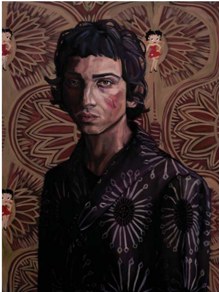
Renaissance Boy, 130 x 97cm, Oil on Canvas