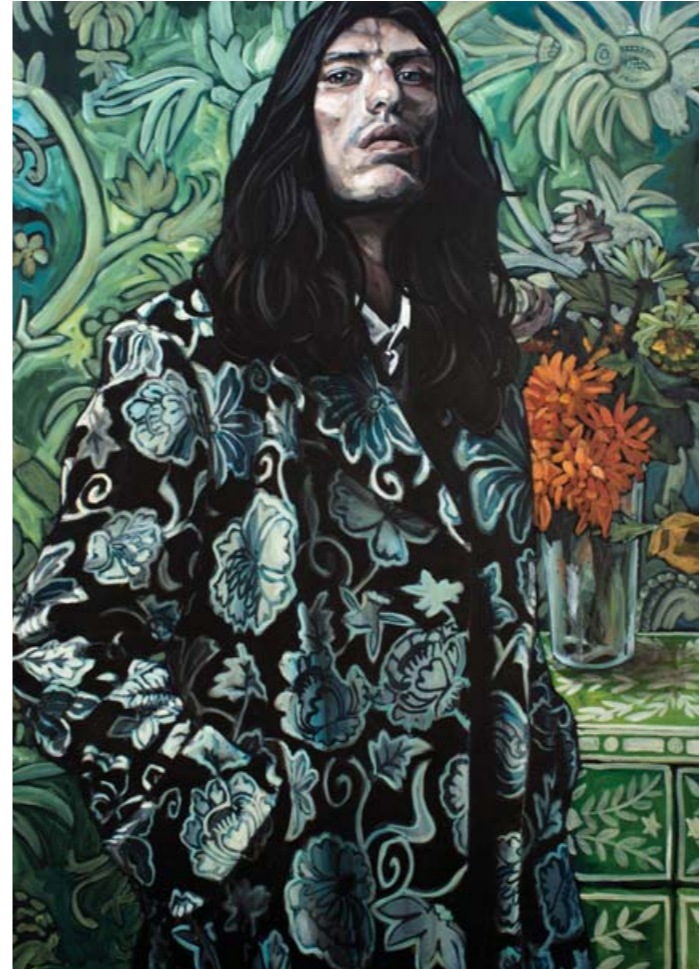
Man with Flowers 116 x 89cm, Acrylic on Canvas

Please note this is a small selection of paintings from the show. Please visit our website at www.cattogallery.co.uk to see the whole exhibition.