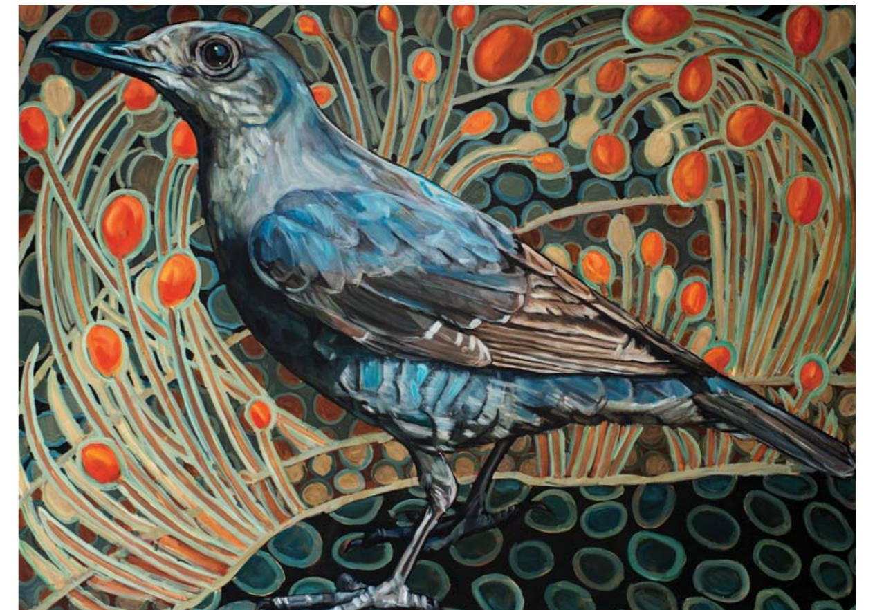
Lockdown Blue Rockthrush II, 97 x 130cm, Oil on Canvas