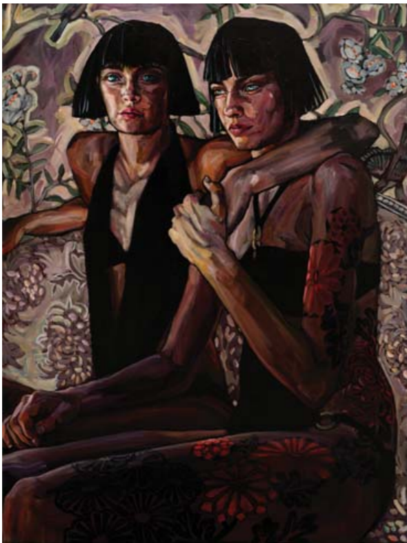
Two Girls, 116 x 89cm, Acrylic on Canvas