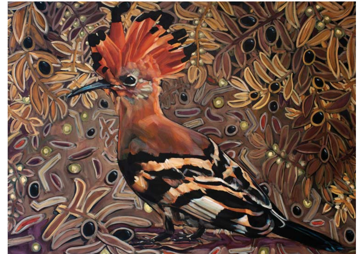
Lockdown Hoopoe IV, 97 x 130cm, Oil on Canvas