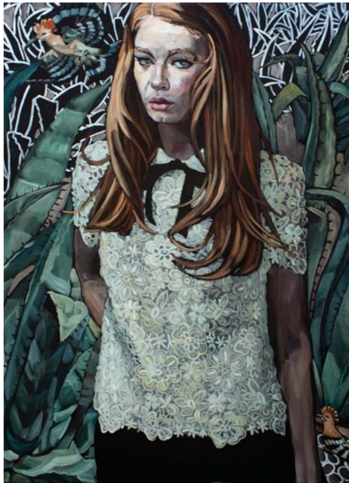
Girl with Agave, 116 x 89cm, Acrylic on Canvas