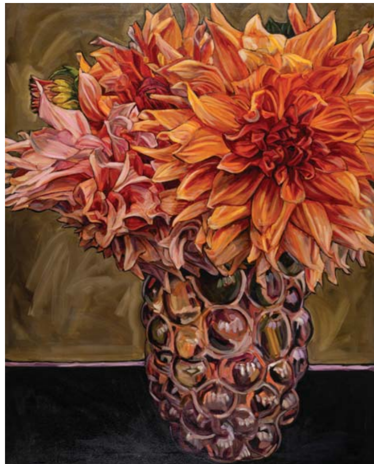
Dahlia III 162 X 130cm, Oil on Canvas