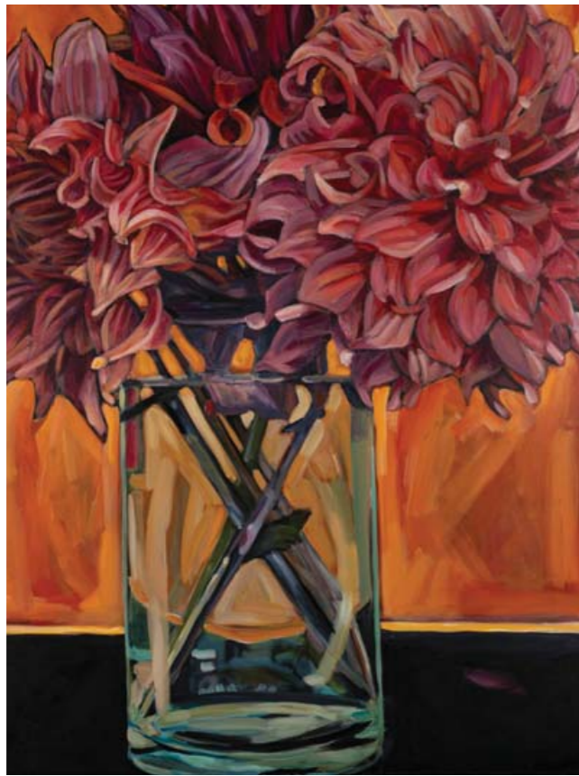
Dahlia IV 120 X 90cm, Oil on Canvas